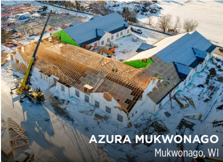
AZURA MUKWONAGO Mukwonago, WI

This 72-unit senior living residence will feature two assisted living buildings and one memory care building along with an array of amenities.