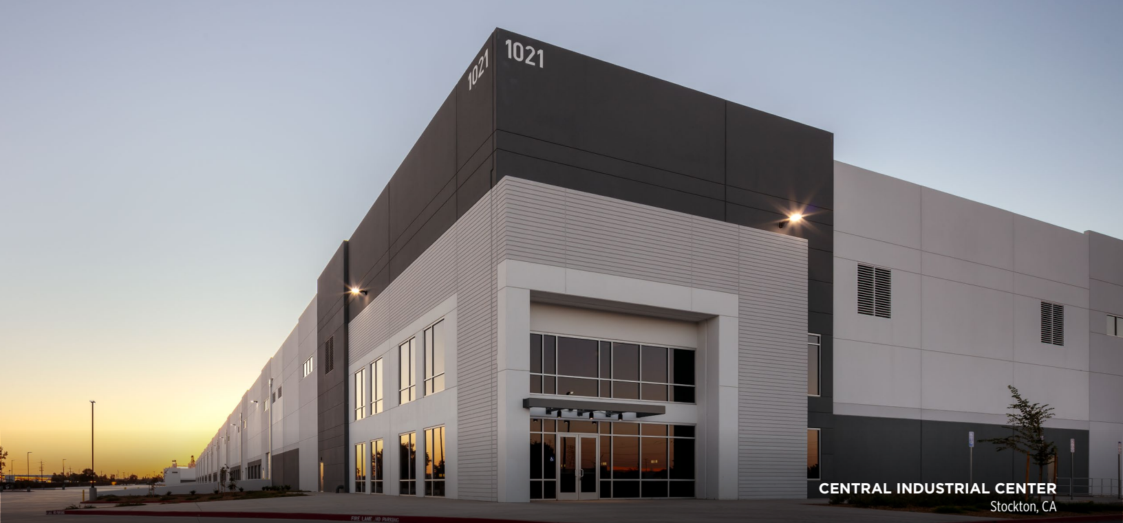
CENTRAL INDUSTRIAL CENTER Stockton, CA