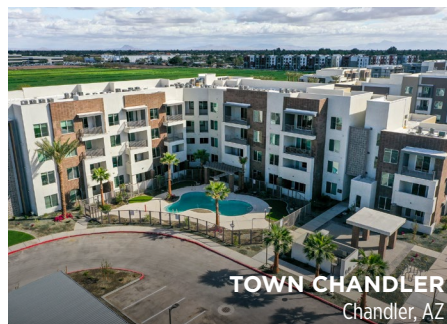
TOWN CHANDLER Chandler, AZ

Located adjacent to Tenney Park in Madison, this development will incorporate 289 apartment units across two podium-style buildings.