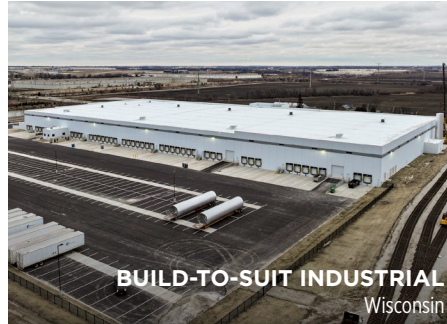
BUILD-TO-SUIT INDUSTRIAL Wisconsin

This 72-unit senior living residence will feature two assisted living buildings and one memory care building along with an array of amenities.