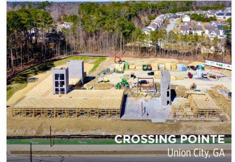
CROSSING POINTE Union City, GA

Construction is nearing completion at this build-to-suit industrial building featuring 372,000 square feet of manufacturing and distribution space.