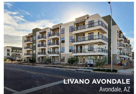
LIVANO AVONDALE Avondale, AZ

This mixed-use community will integrate three buildings offering 332 apartments and 15 ground-floor commercial units near Nashville.