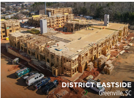
DISTRICT EASTSIDE Greenville, SC

Located near Atlanta, this affordable senior living residence will offer 80 one-bedroom, one-bathroom units.